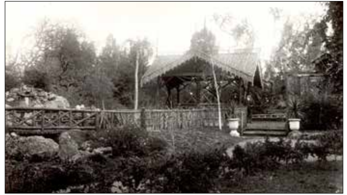
Tea Garden on the Hopkins Estate, circa 1890