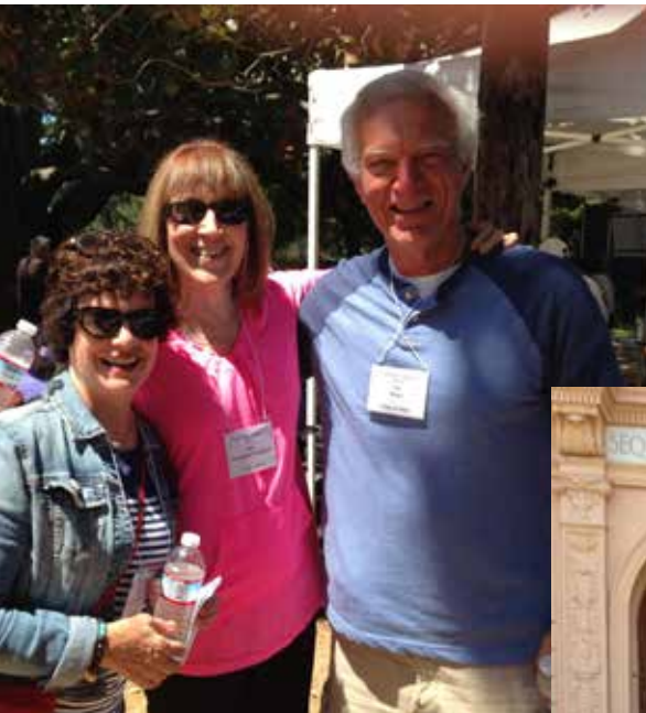
Members of the Class of '64 at their reunion.